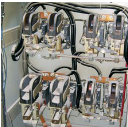
Traditional DC contactors

Working with a long time customer and local Benshaw partner in the motor controls industry, Benshaw has successfully applied a 480VAC 700HP AC variable frequency drive for positioning a MV synchronous motor driven ball mill. The Benshaw variable frequency drive powers the 4160 volt - 3500HP synchronous ball mill motor during positioning to smoothly rotate the ball mill and bring it to the proper position for maintenance. The customer's previous system utilized multiple DC contactors and a motorized cam switch to position the mill. The speed of motor rotation was fixed at a slow 0.18 hertz by the cam switch operation. At this slow speed, mill maintenance took an entire day to complete with the resultant loss of production time.