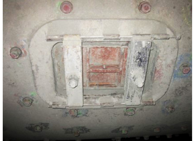
Mill maintenance access door

Traditional positioning technology involves applying a switched DC current to the stator windings in a specific pattern to simulate the sinusoidal AC wave form applied during normal operation while keeping the field excited. In addition to the issue of precisely moving the bulky mill, the cogging or abrupt starting and stopping of the motor can cause mechanical and electrical damage to the equipment. This, along with full voltage starting, stresses the overall electromechanical system and can cause excessive downtime interfering with maximized production.