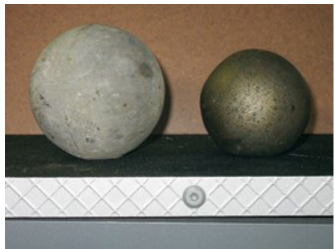
New and worn balls

As the mill rotates and grinds the clinker, the balls are eroded and the liner is damaged by the continuous pounding of the balls. Therefore the balls and liner plates need to be replaced periodically.