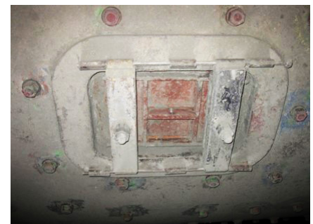
Mill maintenance access door

Traditional positioning technology involves applying a switched DC current to the stator windings in a specific pattern to simulate the sinusoidal AC wave from applied during normal operation while keeping the field excited. In addition to the issue of precisely moving the bulky mill, the cogging or abrupt starting and stopping of the motor can cause mechanical and electrical damage to the equipment. This, along with full voltage starting, stresses the overall electromechanical system and can cause excessive downtime interfering with maximized production.