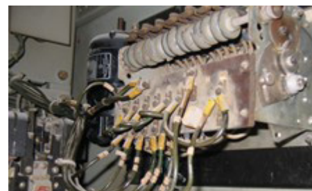
Position timing cam switch

Beyond these advantages, there is an added benefit to working with Benshaw. As a full-line motor controls supplier, Benshaw is able to supply Medium Voltage solid state starters with an integrated synchronous exciter package, and interfaces the variable frequency drive seamlessly into a medium voltage motor control line up. In this particular case, Benshaw supplied a single variable frequency drive that is multiplexed between two mills for additional cost and space savings.