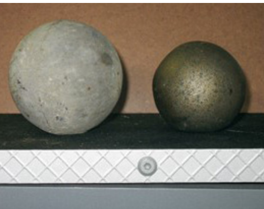
New and worn balls

Ball mills are used in many industries to grind coarse material into a fine powder. A ball mill typically consists of an horizontal cylinder partly filled with steel balls that rotates on its axis, imparting a tumbling and cascading action to the balls. In cement manufacture, clinker is fed into the mill and is crushed by the impact of the balls and ground by attrition between the balls.