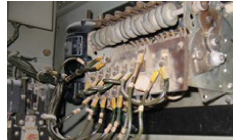
Position timing cam switch

Beyond these advantages, there is an added benefit to working with Benshaw. As a full-line motor controls supplier, Benshaw is able to supply Medium Voltage solid state starters with an integrated synchronous exciter package, and interfaces the variable frequency drive seamlessly into a medium voltage motor control line up. In this particular case, Benshaw supplied a single variable frequency drive that is multiplexed between two mills for additional cost and space savings.