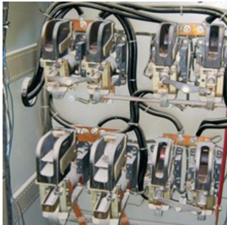
Traditional DC contactors

adjustability to a maximum speed of six (6) hertz. This is thirty (30) times the previous inching speed, allowing the maintenance setup and process time to be significantly reduced. Further, the drive replaces the obsolete and unsupported cam switch, and eliminates the DC contactors and the associated contact tip maintenance.