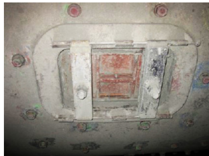
Mill maintenance access door

Traditional positioning technology involves applying a switched DC current to the stator windings in a specific pattern to simulate the sinusoidal AC wave from applied during normal operation while keeping the field excited. In addition to the issue of precisely moving the bulky mill, the cogging or abrupt starting and stopping of the motor can cause mechanical and electrical damage to the equipment. This, along with full voltage starting, stresses the overall electromechanical system and can cause excessive downtime interfering with maximized production.