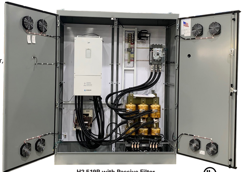
H2 519P with Passive Filter